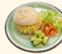
(v) Cheddar Cheese (G.D)