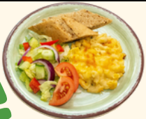
(v)(h) Mac 'n' Cheese (G.D)