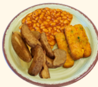
(vg) Garden Vegetable Fingers (G)