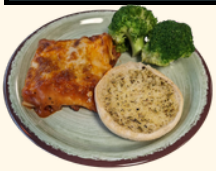
(h) Beef Lasagne (G.D)