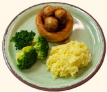
(v) Plant Power Toad in the Hole (G.E.D)