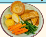
Roast Chicken Fillet Yorkshire Pudding (G.E.D)