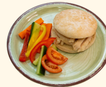
British Roast Chicken (G)