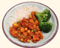
(v)(h) Vegetable Curry