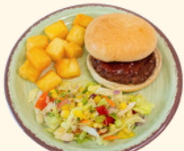
(vg) Plant Power Burger (G)