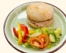
Tuna Mayonnaise (F.E.G)