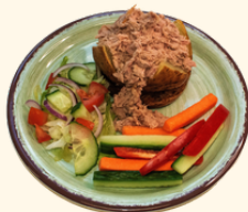
Tuna Mayonnaise (F.E)