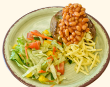
(v) Cheese/Beans (D)