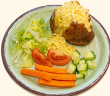
(v) Cheese (D)