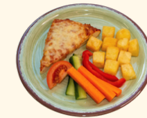
(v) Cheese & Tomato Pizza Wedge (G.D)