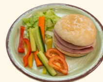
British Ham (G)