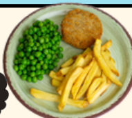
Salmon Fishcake (F.G)