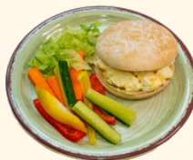
(v) Egg Mayonnaise (G.E)