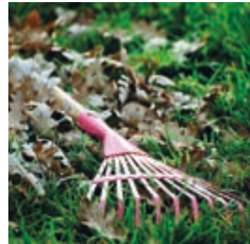
Raking up leaves