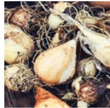
Bulbs ready for planting