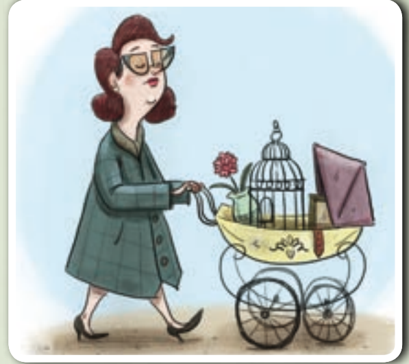
Dora the Storer